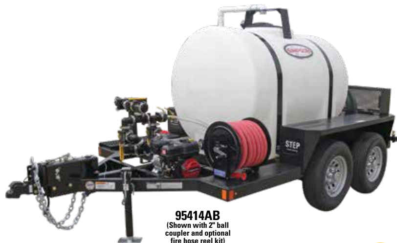
95414AB (Shown with 2" ball coupler and optional fire hose reel kit)