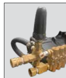
EXTERNAL UNLOADER WITH BYPASS HOSE