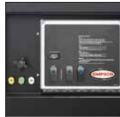
Control panel and on-board nozzles

All Units L 30" x W 45" x H 42" | 636 lbs.