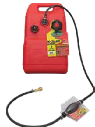
Includes 6-gallon external fuel tank