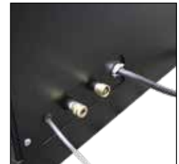
Detergent siphon hose, quick-connect and garden-hose connections