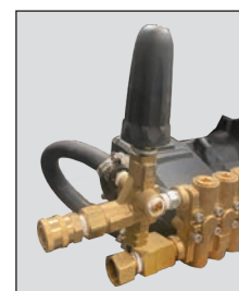
EXTERNAL UNLOADER WITH BYPASS HOSE