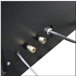
Detergent siphon hose, quick-connect and garden hose connections

NOTE: Movable water inlet/outlet point (3 different locations - front, side, or back)