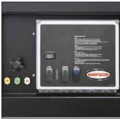
Control panel and on-board nozzles

All Units L 30" x W 45" x H 42" | 636 lbs.