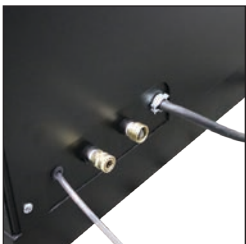
Detergent siphon hose, quick-connect and garden hose connections

NOTE: Movable water inlet/outlet point (3 different locations - front, side, or back)